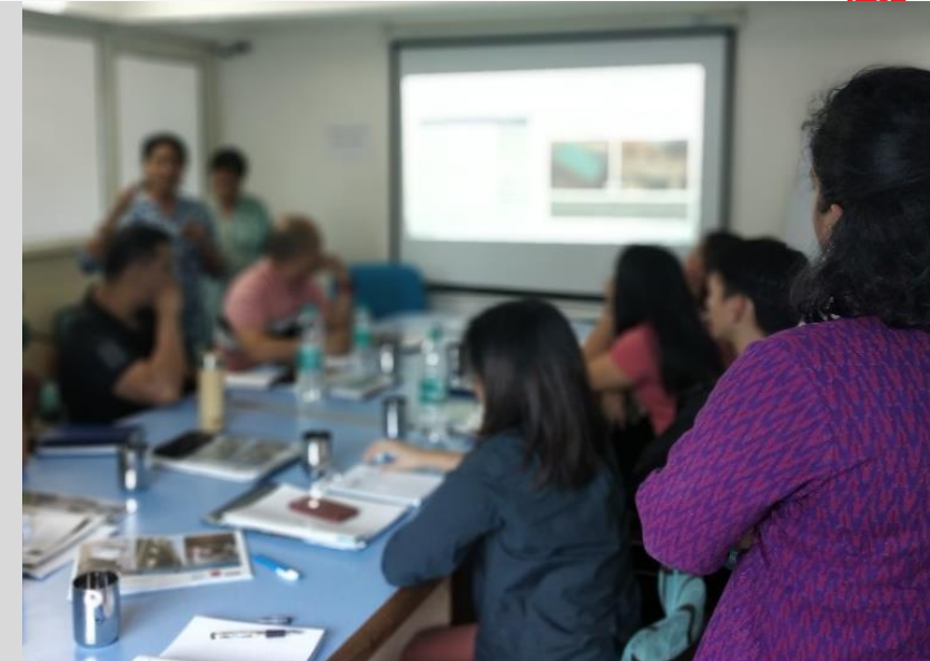
Discussions at MHT office, Ahmedabad