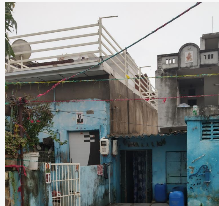
Above: Mod Roof Below: Mod roof with Airlite

** Mod Roof : The modular roofing system (Mod Roof) is a waterproof roofing, made of paper waste & coconut husk. It is an environment-friendly alternative to the RCC roofing system. It is also easily dismantable, and could be reinstalled after adding additional floors, or taken to new locations.