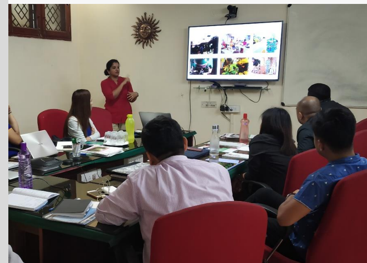
Discussions at SELCO Foundation Head Office, Bangalore