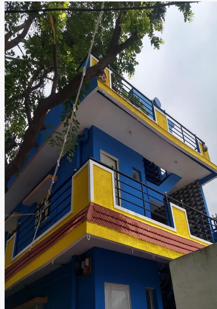
Energy Efficient House, Bangalore

Concept Note Presentations from MCPI, KDCI, K-Coop