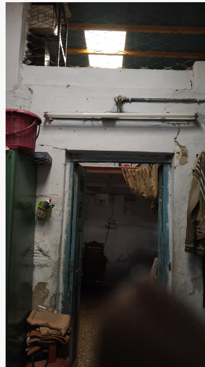
Airlite installation, Ahmedabad