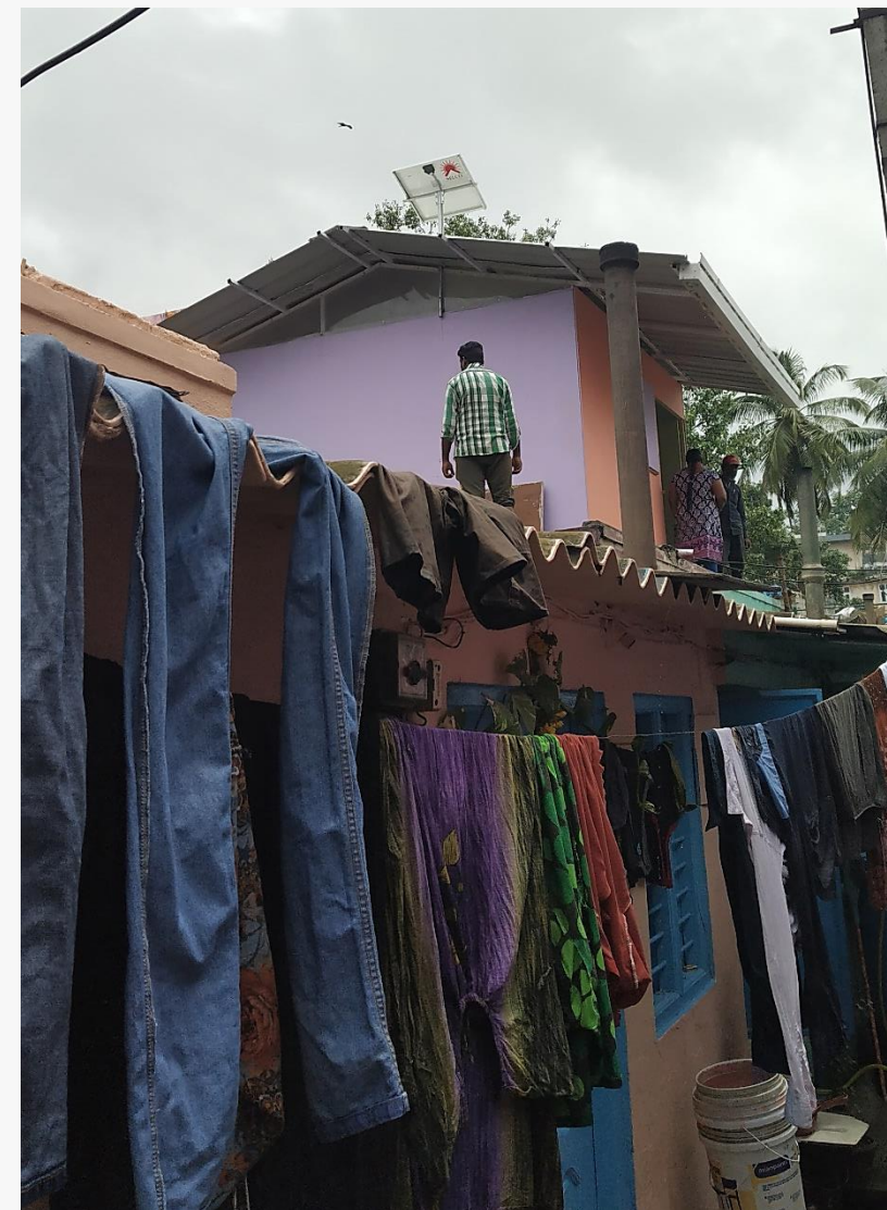
Extension Housing in Bangalore

In the partnership, SELCO Foundation would have an advisory and technical support role in terms of strengthening the program (capacity building, programmatic inputs, support in establishing processes, facilitating a knowledge transfer platform and technical assistance support in pilot implementations.